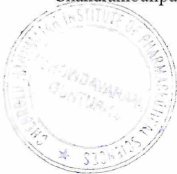
Signature of the Authorised Person